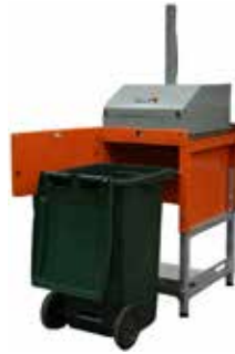
Designed to fit the standard 240 Liter bins in the market.

The 4240 is perfect for the hotel and restaurant sector, where general waste needs to be disposed of in waste bins. The in-bin compactor provides impressive volume reduction, contributing to valuable space-saving and a more profitable waste management.