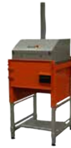
The single-chamber unit with swing door