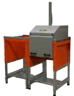
The multiple-chamber unit equipped with an apron with two handles