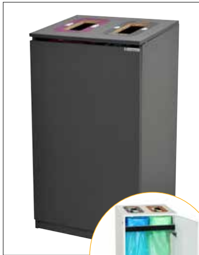
Bin Multi 2