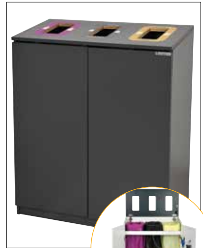
Bin Multi 3