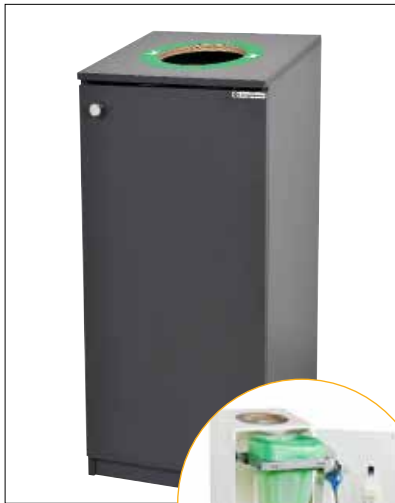
Bin Multi 1