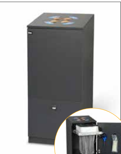
Bin Multi Cup