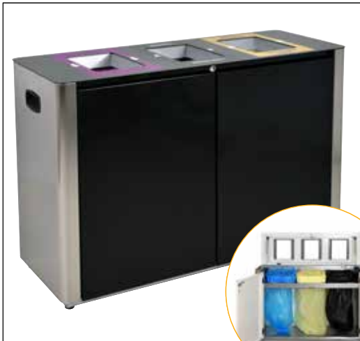
Commerz (only for indoor use)

Commerz is a modular waste station that with its elegant design easily can be placed in different types of indoor environments such as offices or other public areas such as train stations, airports, schools, etc.