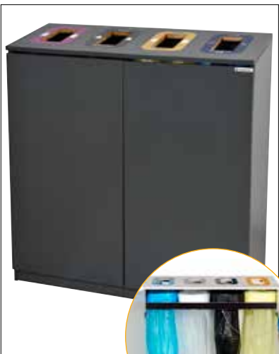
Bin Multi 4