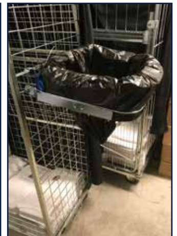
MINI (Art. nr. 34300)

Height..... 159mm Width..... 374mm Depth ..... 264mm Opening..... 284x164mm