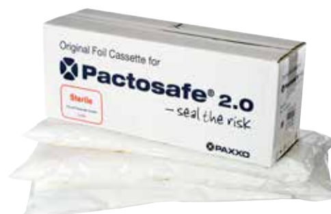
PACTOSAFE STERILE CASSETTE (3 x 40m) Item No. 10850

Each cassette is packed airtight and sterilized.