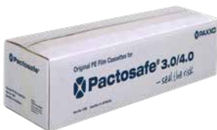
PACTOSAFE CASSETTE (4 x 40m) Item No. 10880

In conclusion, it is important for all caregivers to handle hazardous waste in closed systems to prevents dangerous toxins spreading but also for other segments stopping the spread of bad odours.