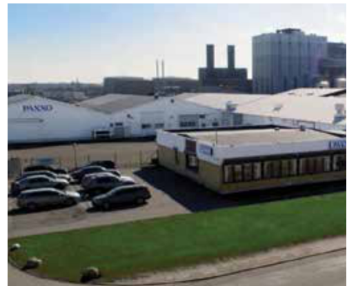
Paxxo was founded in 1980 based on making continuous liners.

We offer the Longopac for Dust in several different strengths and three different formats: Maxi, Midi and Mini. We also offer with guaranteed levels of anti-stat for ATEX environments.