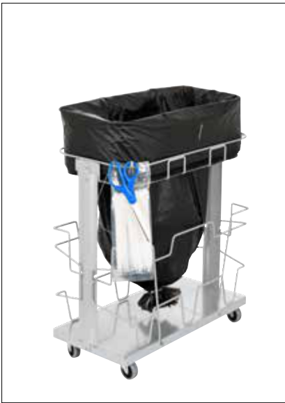
Stand Midi Dynamic UBS