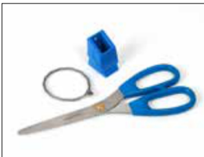
Scissors kit for Longopac Stand Dynamic, metal-detectable Item no. 34609 Kit containing metal-detectable scissors, scissors holder, stainless steel wire.