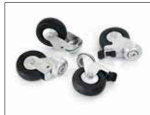
Stand DynamicESD Kit Wheels Item no. 34616 Contains four castor wheels, two of them with brakes. Replaces the original wheels on stands used in ESD restricted areas.