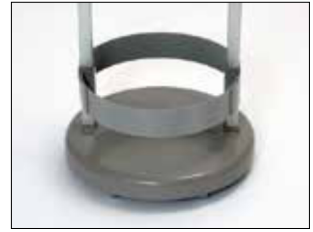
Frame for Longopac Stand Classic Mini Item no. 33890 The frame holds the bag in place.