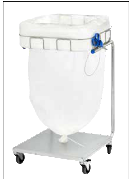
Stand Dynamic Maxi/Maxi Pedal