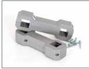
Connector for Longopac Stand Classic Item no. 33750 Connects two or more Longopac Stand products simply and securely. It is also possible to connect Maxi to Mini.