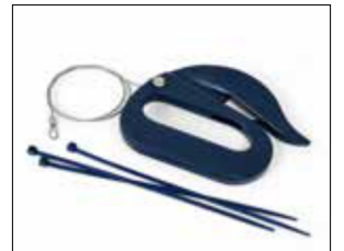
Safety kit Cutter blue kit Item no. 30440 Contains cutter, metal de-detectable PP. Wire in stainless steel and cable ties, metal detectable PA