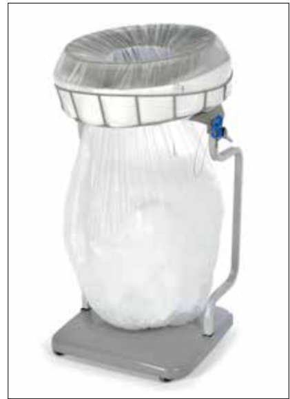
Stand Classic Recycling