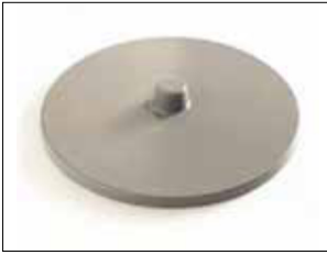
Lid for Longopac Stand Classic Maxi and Mini Mini Item no. 31140 Maxi. Item no. 30140