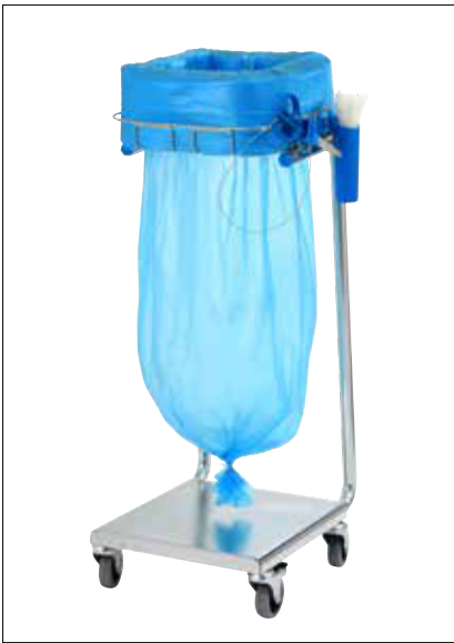
Stand Dynamic Mini/Mini Pedal