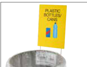
Sign holder for Longopac Stand Classic & Dynamic For item no. see charts on Stands and Dynamic. Signs are available in A4Portrait or A5Landscape.