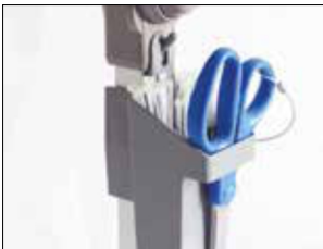
Cable-tie holder for Longopac Stand Classic Std grey. Item no. 30410 Metal-detectable, blue. Item no. 30416 The cable-tie holder is suitable for both Maxi and Mini, and available in two versions.