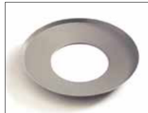
Adapter disc for Longopac Stand Classic Maxi Item no. 30170 Reduces the aperture for easier compression of e.g. recycled plastic. Only available for Maxi.