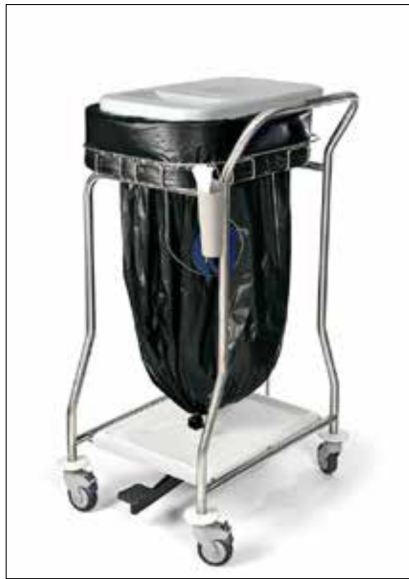
Stand Midi Nouvo Pedal