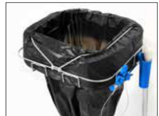
Rubber band Item no. 3102 This accessory can be used together with all Longopac cassette holders. Effectively locks the cassette in place and prevents it from unravelling.