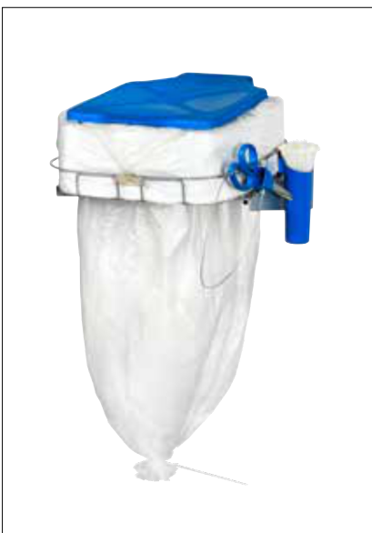
Mini Flex with lid

Two new products have been added below. Mini Flex with a lid and the first Midi version. Wall-mounted solutions are ideal for areas with limited space and where hygiene is important. They also facilitate cleaning.