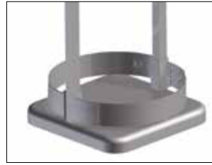
Frame for Longopac Stand Classic Maxi Item no. 33900 The frame holds the bag in place.