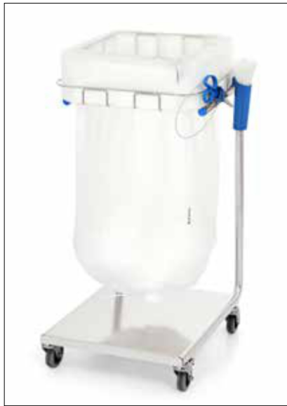
Stand Dynamic Midi/Midi Pedal