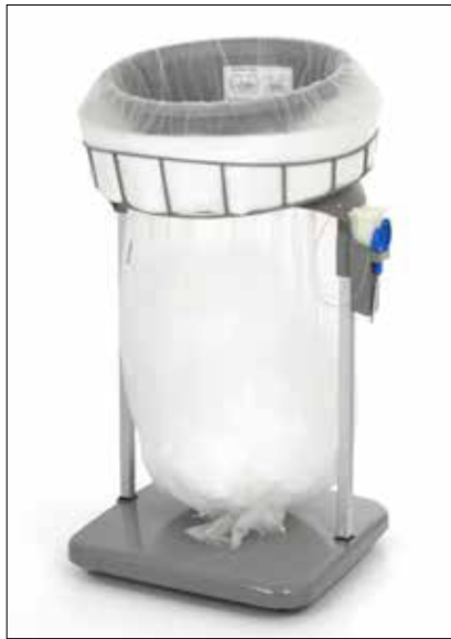
Stand Classic Maxi/Maxi Food