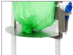
Adjustable plate for Stand Classic Mini Item no. 31480 Reduces the consumption of bag material and reduces the size of the bag. Primarily intended for use with sticky, heavy waste. Can be used for Bio bag cassettes.