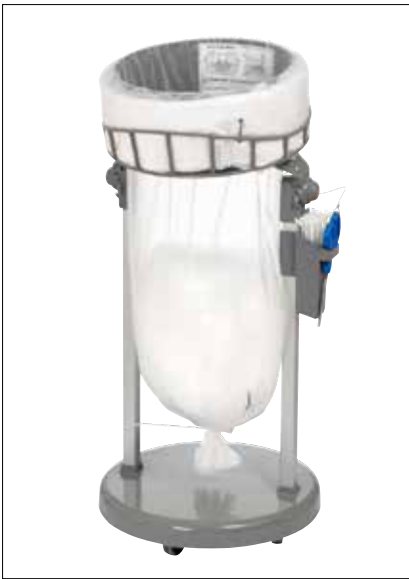
Stand Classic Mini/Mini Food