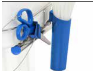
Cable-tie holder for Longopac Stand Dynamic Item no. 30410 (onlyholder) The cable-tie holder for the Dynamic range is suitable for Mini, Midi and Maxi Dynamic.