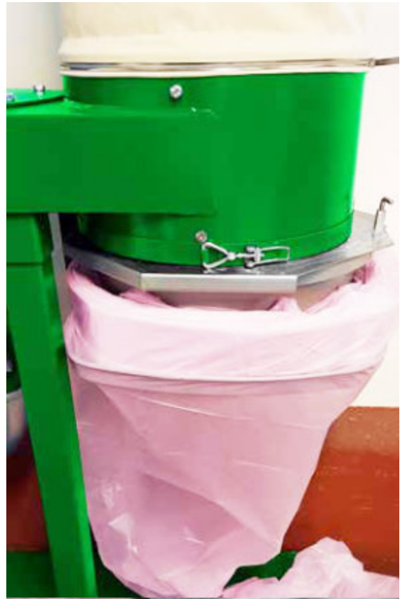
ESD anti-staticcassette bag

The cassette is a continuous liner, manufactured in environmentally sound polythene that can be incinerated without any hazards. Each cassette bag is up to 90m long.